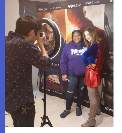
SUPERGIRL FLEW IN FROM NATIONAL CITY TO ATTEND OUR EVENT