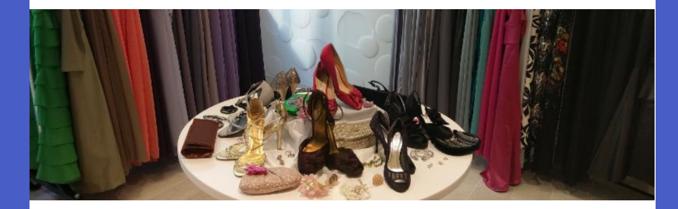
For One Last Time, Special Thanks to Our D4D Sponsors: