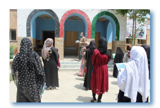
Afghanistan's COVID response