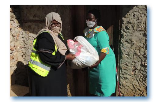
Kenya's COVID response

As crises and violent settings change, local women peacebuilding organizations (WPBOs) adjust their work to respond. The onset of COVID-19 impacted our partners' existing work, but they did not and could not stop their peace work.