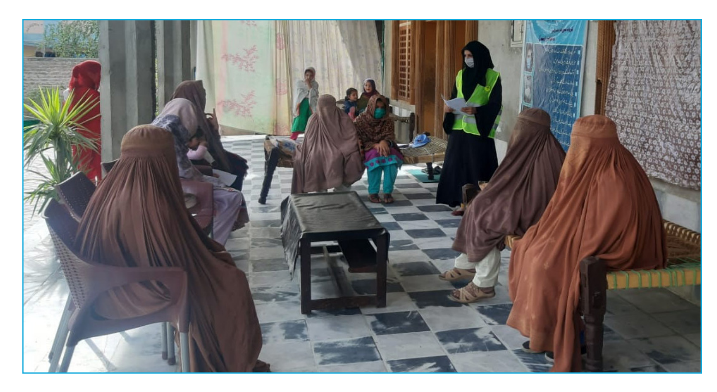
Photocaption to be placed here

They identified the following four thematic activities: promoting peace, resilience, equal rights, and pluralism (PREP); increasing women's representation and gender sensitivity in peace and security policies, addressing conflict-related sexual and gender-based violence; and deradicalization, rehabilitation and reintegration of fighters.